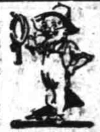
WHOLE BURN STATE

This is the time of the year when sore throat is prevalent. When the body cannot quickly adjust itself to changes of temperature and is a bit rundown, then cold settles in the weak places. In tonsillitis or sore throat there is a quick rise of temperature, headache and general aching. Swallowing is painful and difficult.