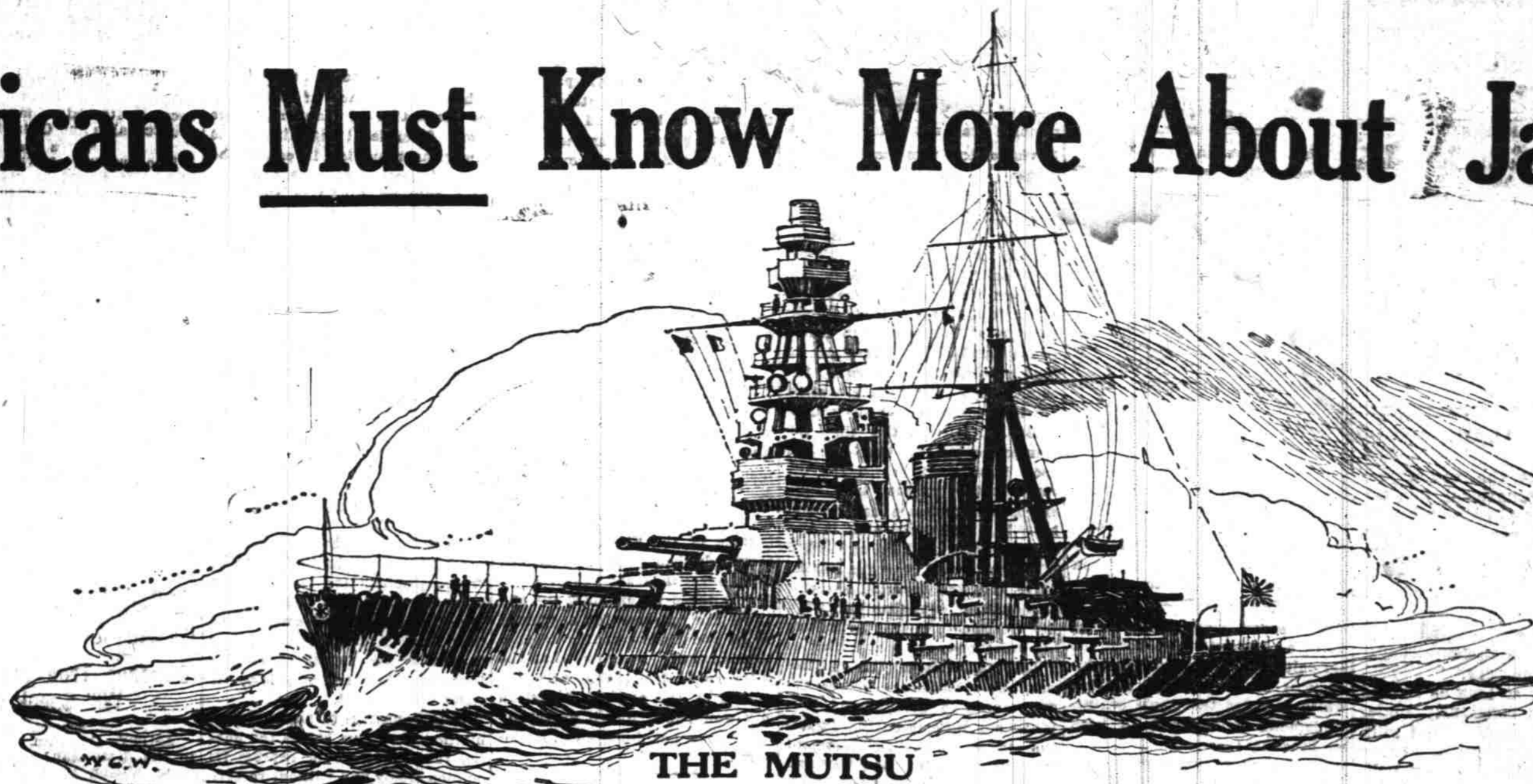
THE MUTSU Japan's newest and greatest battleship, regarded as the popular symbol of Japanese naval progress and aspirations. The pride of Japanese naval architects. Reported to have been built largely by the pennies of millions of Japanese children and the voluntary sacrifice of Japanese laborers. Japan is permitted to keep this battleship when the plan of naval reduction is carried into effect.