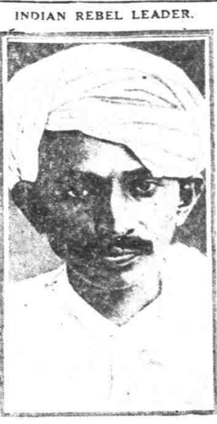
Mohandas K. Gandhi blames himself for the disturbances in Bombay during the visit of the Prince of Wales and bids the rioters to pray and repent.

$3.00 Round Trip to Portland Every Day—Oregon Electric Railway The Oregon Electric Railway sells round trip tickets to Portland for $3.00 including war tax, for return on and including the second day from date of sale.