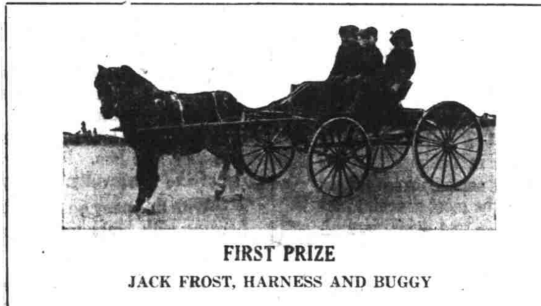
FIRST PRIZE JACK FROST, HARNESS AND BUGGY

Think of it! Four handsome and valuable ponies and outfits and cash prizes to be awarded to four proud and happy boys or girls just at the dawn of summer, when boys, girls and ponies love to roam around and enjoy one another's company. Just at a time when you can turn your pony out to graze on a nearby piece of land and it will cost you nothing to feed him. Admirers of the lovely little Shetlands will no doubt hail with delight the announcement of such sensational prizes as four valuable ponies and driving outfits particularly when it is understood that if for any reason a pony is not won a cash commission will be paid on all subscriptions received from active candidates. Could anything be fairer or more reasonable? Boys and girls have everything to gain and absolutely nothing to lose. Over one hundred boys and girls have already secured ponies and outfits by employing their spare moments and never lost a day at school.