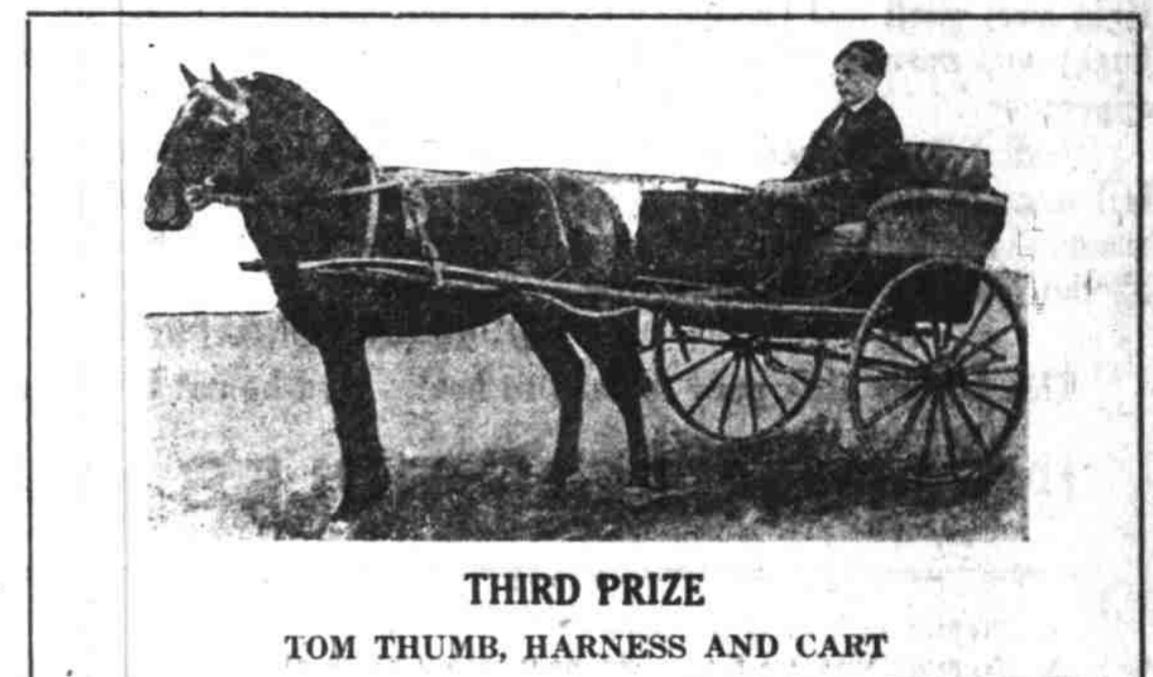
THIRD PRIZE TOM THUMB, HARNESS AND CART