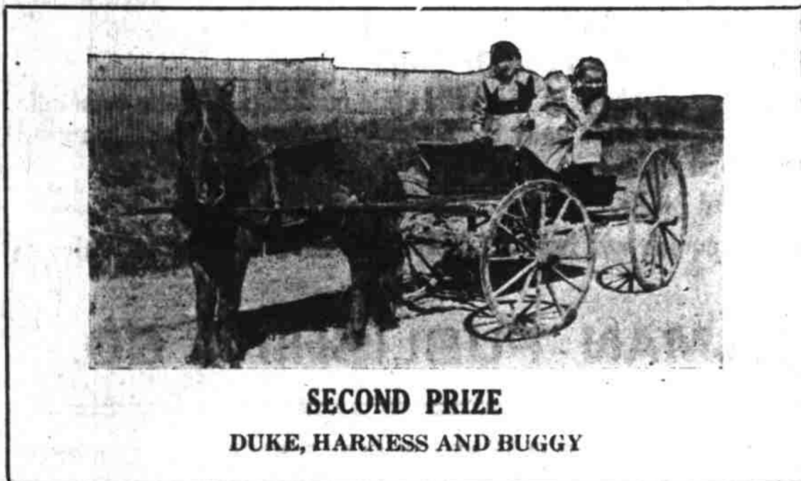
SECOND PRIZE DUKE, HARNESS AND BUGGY