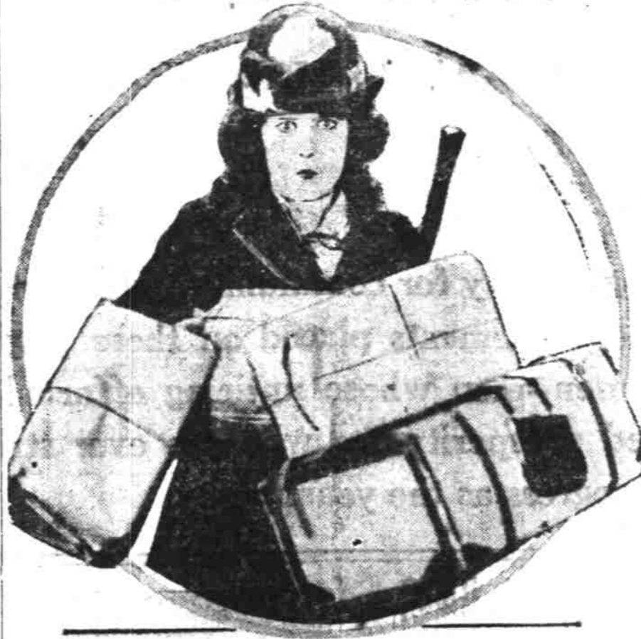
Although Christmas is several weeks away, it is not too early to start your holiday shopping. If you wait you will be in the same predicament as this girl, weighted down with bundles and not knowing which way to turn in the last minute rush.