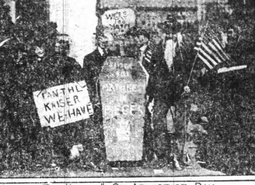
"KANNING THE KAISER" ON ARMISTICE DAY