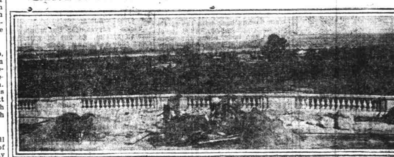
Preparing the grave of the Unknown American Soldier, who will be buried in the National Cemetery at Arlington on November 11. The spot is a beautiful one in the hills of Virginia, overlooking the city of Washington.