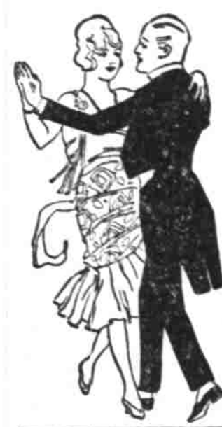
Get That Firm Flesh, "Pop" and Healthy Glow of Youth—Take Mastin's Yeast VITAMON Tablets.

Concentrated Tablets Easy and Economical to Take—Results Quick.