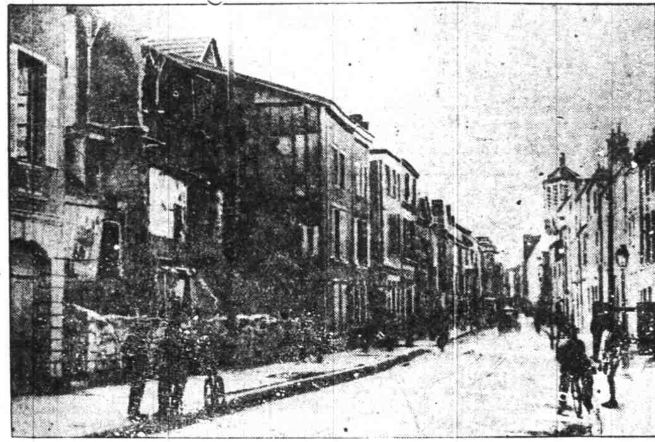
RUINS ABOUT THE CITY HALL IN CHATEAU THIERY

From October 30 until November 2 the American Legion held its annual convention in Kansas City. Great Britain, France, Italy and Belgium will be represented at the conference. At least twenty Governors from different States throughout the country are expected to attend. American leaders will be represented by General Pershing. A parade will be held, in which 40,000 ex-service men will take part. Many of the boys will exchange glances and greet their "buddies," who many have not seen since they parted three years ago. Many of the ruined villages have been rebuilt, but a great many of them still look the same as when the American lads departed. These pictures will help bring back to mind the days when they were in "the big thing." These pictures, which were taken ten days ago, are an example of what has been done in three famous cities since American troops left France. One shows all that remains of the American Base Camp at Brest, where the majority of American soldiers were killed, and where they were later embarked for home. Another shows the ruins about the City Hall of Chateau Thierry, which