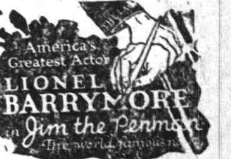
LIBERTY Next Thursday

Simpson (greeting his old friend)—Why, Jones, it's ages since I saw you last. Married now aren't you? Jones—No, no, old man, it's not that. Just business worries and nerves.—Sydney Bulletin.