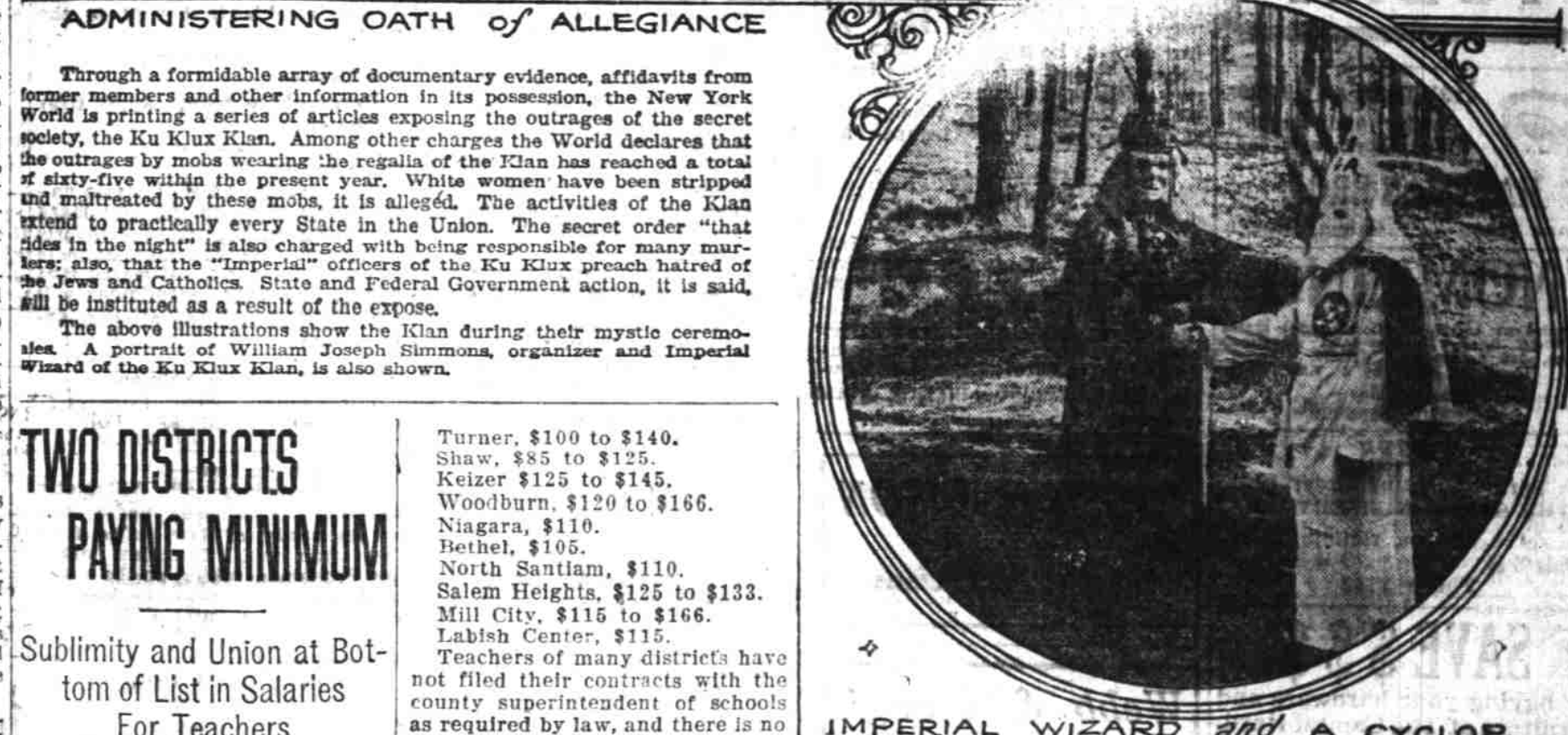
ADMINISTERING OATH OF ALLEGIANCE

Through a formidable array of documentary evidence, affidavits from former members and other information in his possession, the New York World is printing a series of articles exposing the outrages of the secret society, the Ku Klux Klan.