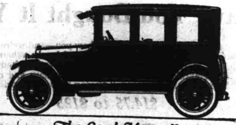
The Good Maxwell