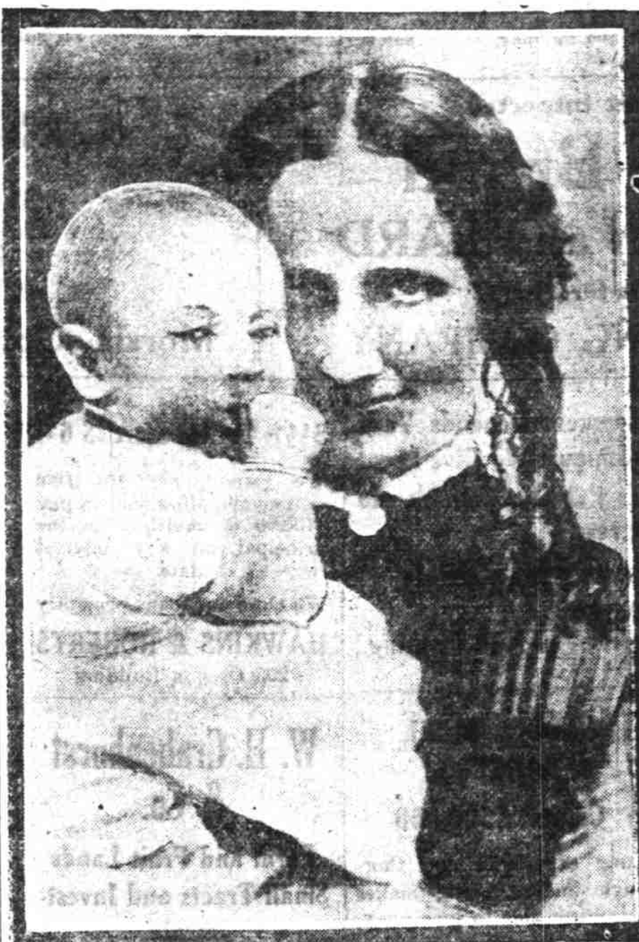
This picture of Mary Baker Eddy, the founder of Christian Science, was taken in the early years of her work in establishing her church. The baby she is holding is the child of a friend. Her centennial was recently observed both in this and other countries.