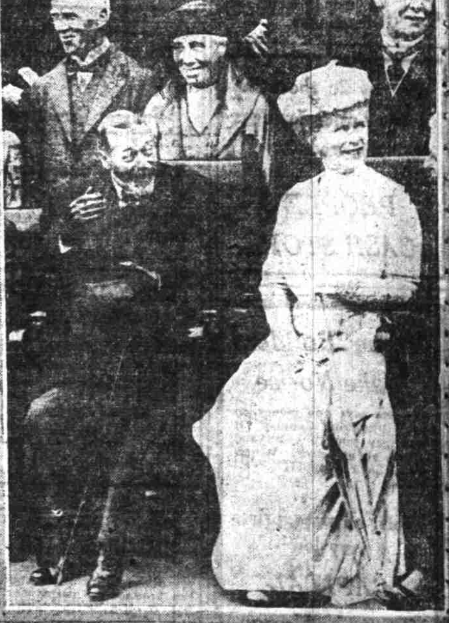
The latest photograph to arrive in this country of King George and Queen Mary of Great Britain, taken while they attended the opening of the great Red Triangle Club at Plaisant. They were the guest of honor, and to the King fell the task of making the opening speech.