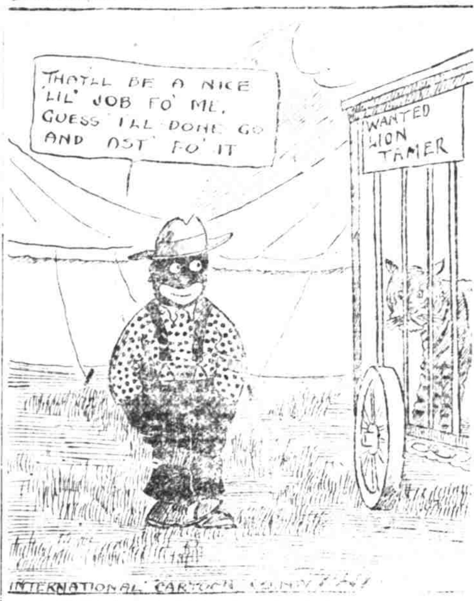
INTERNATIONAL CARTOON COMPANY

Hood River and the forest service having awarded a contract for six miles a few days ago. Hood River Assists The uncompleted portion between Government camp and the end of the Hood River contract is 17.2 miles which it is proposed to bring up on the 1922 construction program. "Considerable interest in the Mt. Hood loop is being manifested in Hood River county, where the county is voting on a $320,000 bond issue to cooperate with the highway commission on the construction of the road through the Hood River valley between the forest boundary and Hood River, a distance of approximately 21.5 miles."