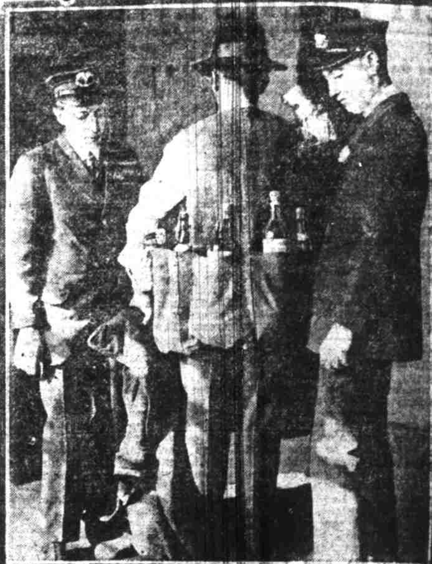
One ingenious method of smuggling contraband liquor into this country has been exposed by United States Custom guards, as seen in the picture. Never in the history of the country have smugglers, banded together and individually, worked so ingeniously and persistently as at present to cheat the government and successfully land dutiable and banned articles which bring unreamed profits. In the port of New York city not more than a dozen Custom searchers are used to cover the whole area. The crippled custom staff is baffled and fortunes are made on one trip by the smugglers.