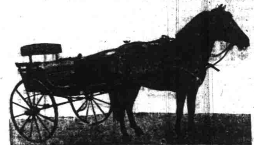
THIRD PRIZE Madame Trixy, Harness and Cart