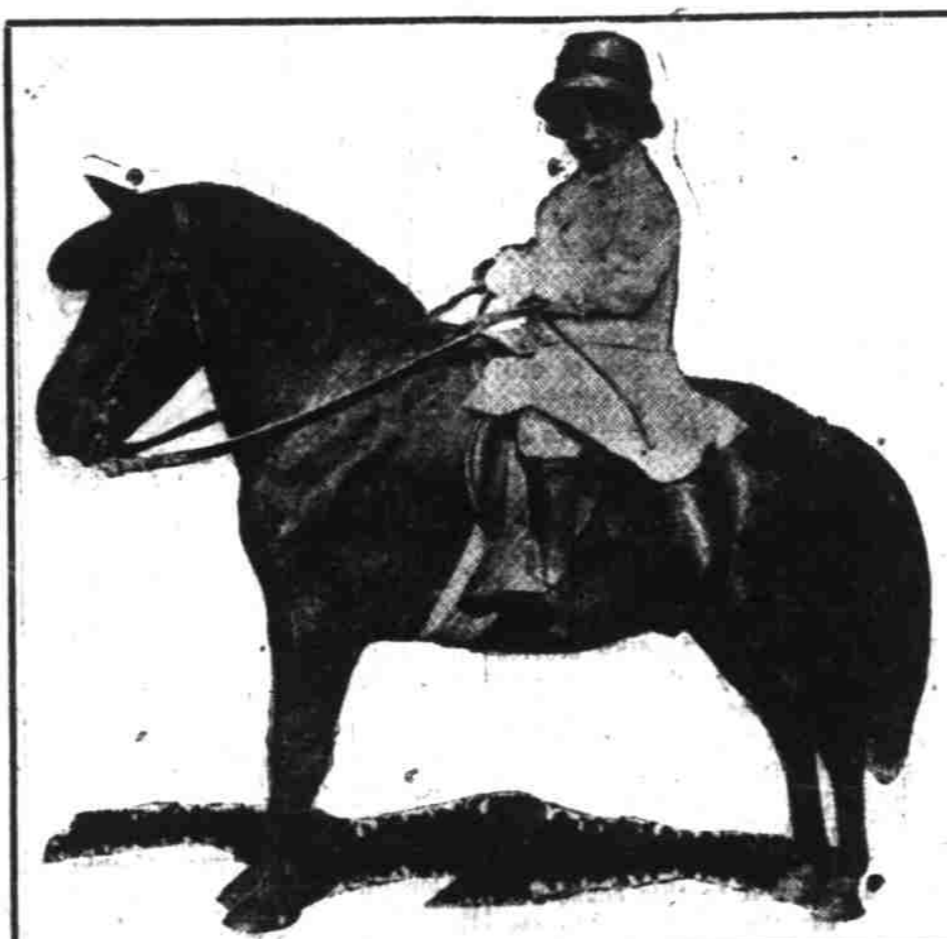
FOURTH PRIZE "Sparkle," Saddle and Bridle