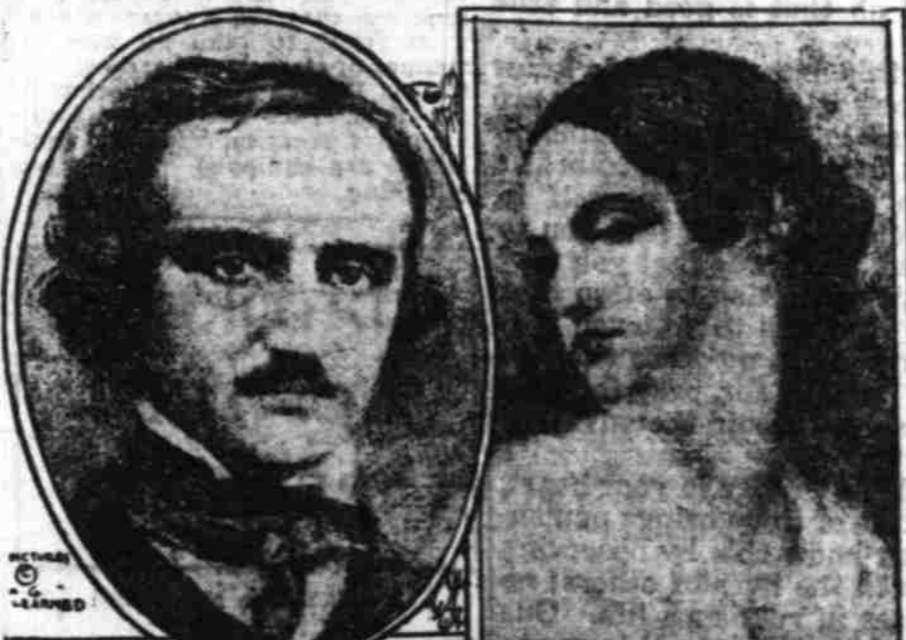
EDGAR ALLAN POE, HIS WIFE AND THEIR COTTAGE