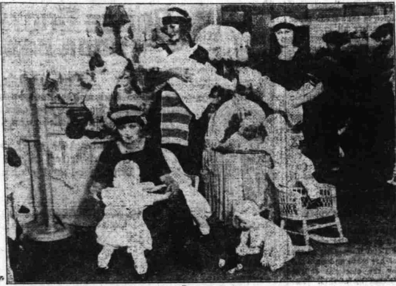
The above cut shows the interior of The Madame Georgene Shop, 309 Fifth Avenue, New York City.