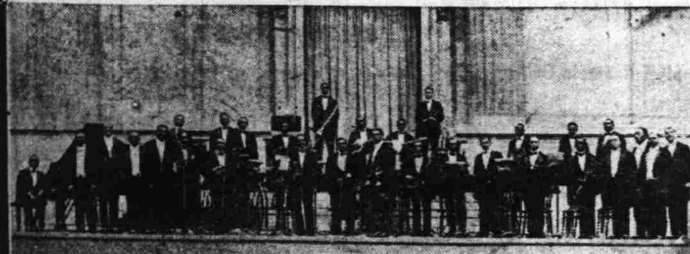
As they appeared at the Greek Theatre, Berkeley, Calif.