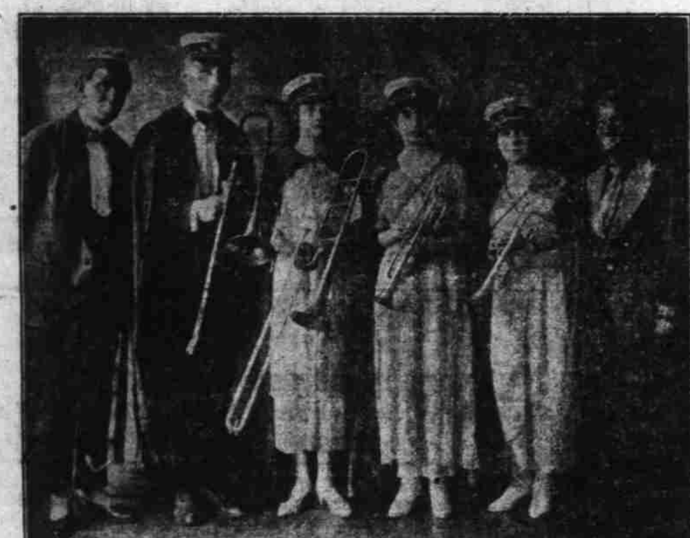
MILO'S MERRY MINSTRELS

Band Orchestra Singers Dancers and Blackface Comedians