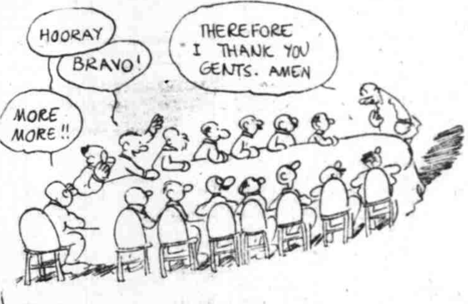
INTERNATIONAL CARTOON CO. 1306

AN AFTER DINNER SPEAKER FINISHES HIS FORTY-FIVE MINUTE SPEECH ON 'WHY CATERPILLARS SHOULD BE ELIMINATED FROM OUR SOCIAL METROPOLIS AND ALL THE MEMBERS ARE AWAKE AND HEALTHY'