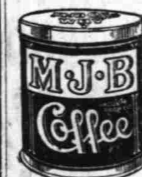
Remember We Stand Behind It.

There is no better coffee than M.J.B. Coffee regardless of price—WHY?