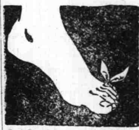
Don't Be a Corn Cripple—Use "Gets-It"

There isn't room on the same toe for a horn and two or three drops of "Gets-It," so the corn curls up, shrivels and peels off in your fingers so easily that you are simply astonished, because you can't feel it.