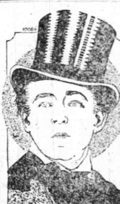
JOHN BARDYMORE in "DR. JEKYLL and MR. HYDE" A PARAMOUNT AIRCRAFT PICTURE

(Copyright 1915 by Williams Publishing Co. All rights reserved.)