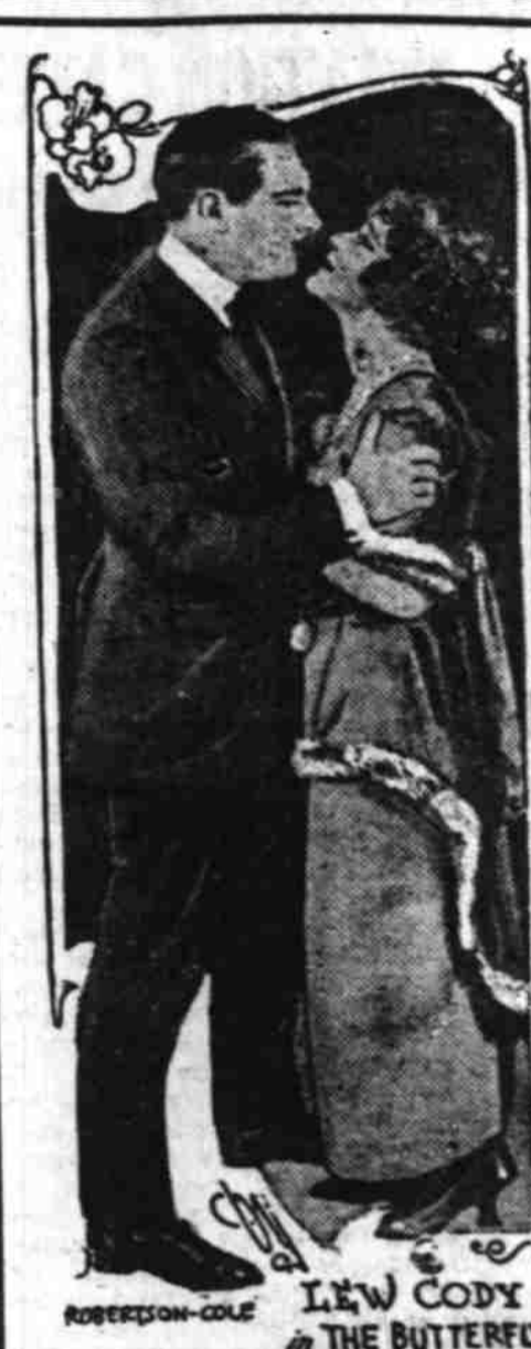
LEW CODY in THE BUTTERFLY MAN