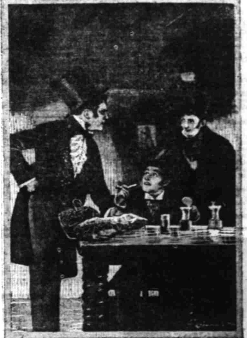
Portrait of Robt. H. Ingersoll & Bro.