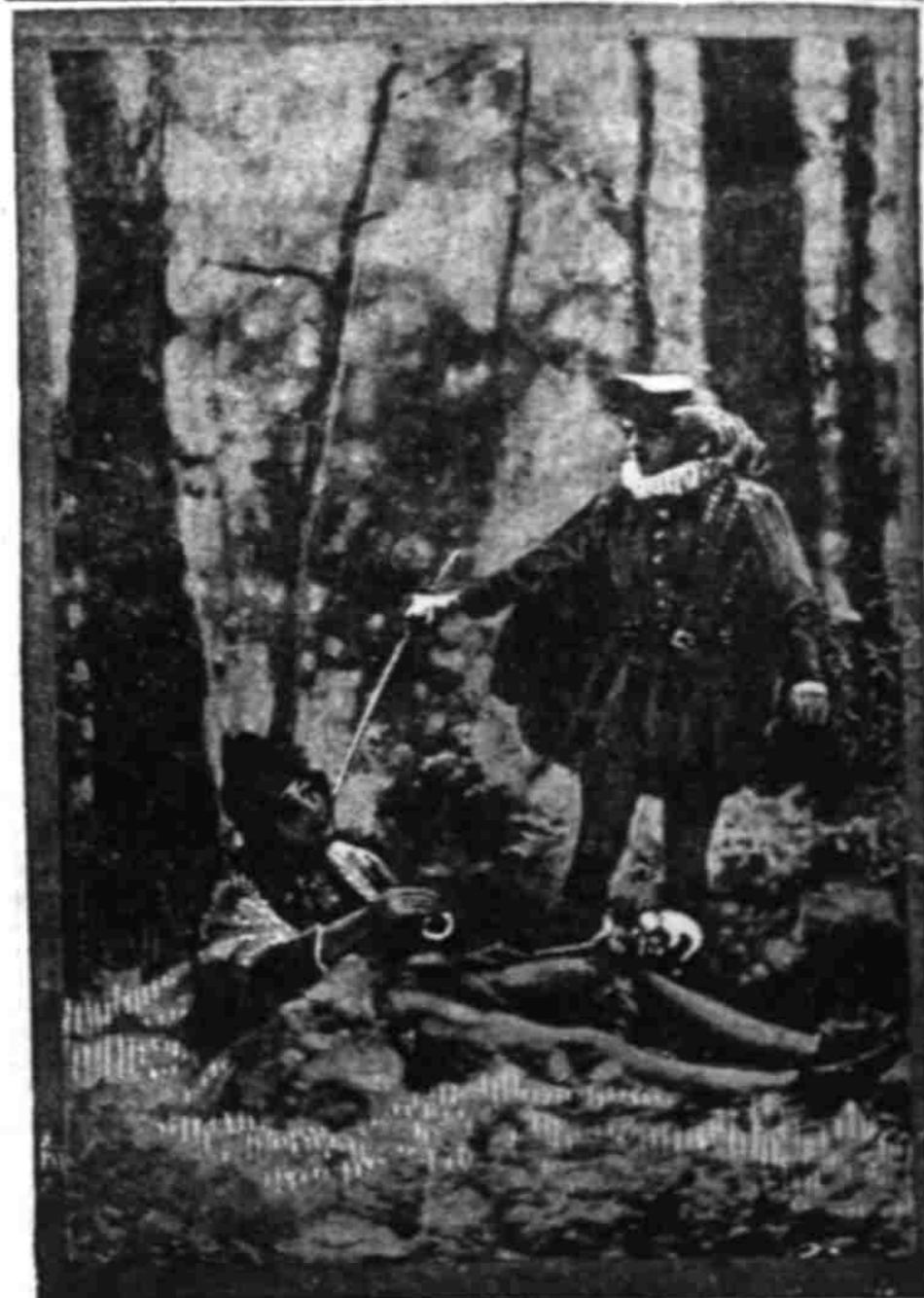
Permitted by Robt. H. Ingersoll & Co.

This picture shows us "Jacques" meeting "Touchstone," the fool, as recounted in Shakespeare's "As You Like It," and takes us back to the ancient principle of the sundial. You couldn't put the cave man's boulder nor the "Dial of Ahar" into your pocket and yet civilization had reached a point at this period where it required a pocket timepiece. Therefore, man invented the "napkin ring dial" in which a beam of sun-light fell through a pin hole in the rim upon a graduated scale on the inner surface.