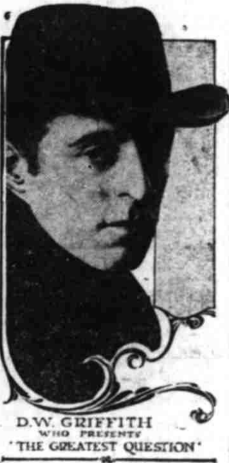
D.W. GRIFFITH WHO PRESENTS "THE GREATEST QUESTION"