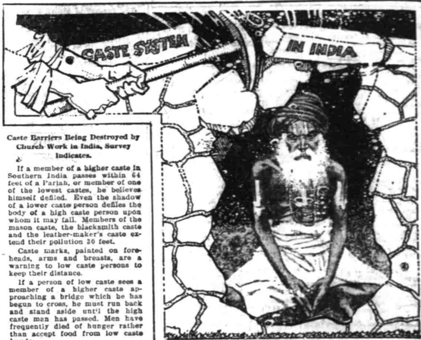
A Pariah Who in East Indian Social Life is Almost Lowest of the Low; Marks Painted on His Arms Denote His Caste.

It is impossible for them to adhere to caste regulations. Already the social life of India, the survey finds, has felt the impress of the work of Evangelical missionaries in their individual fields. And the progress of Christian Churches in India has done its part to wipe out the old caste standards.