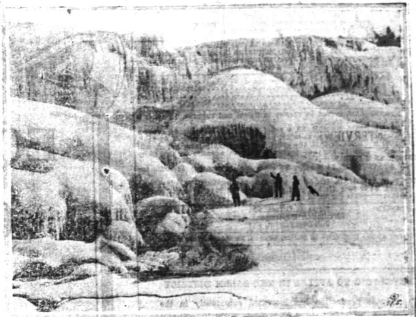
Niagara Falls, majestic in summer, is doubly impressive in its winter garb of white. Now the roar of the rushing waters is muffled by great walls and banks of ice, and ice and snow cover rocks and river. This photograph shows hardy tourists looking up the ice-bound falls.

ly live at 424 North Eighteenth show their appreciation of patronage bestowed upon them.