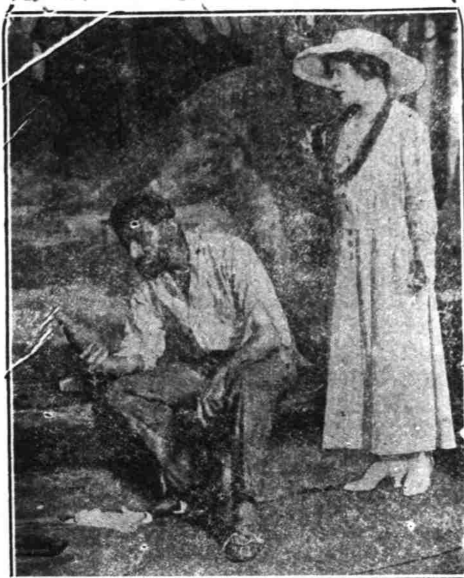
Scene from Bird of Paradise at the Grand Opera House Tonight.

The only play on the American stage today that deals with life on the Hawaiian Islands, those beautiful Pacific ocean possessions of Uncle Sam, namely, "The Bird of Paradise," will again be seen at the Grand Opera house tonight, Feb. 18.