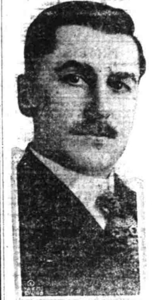
Edwin L. Meredith

In choosing Edwin L. Meredith of Des Moines, Iowa, to succeed David F. Houston as secretary of agriculture President Wilson selected a practical farmer as well as a business man. Mr. Meredith is the editor of Successful Farming and before establishing that paper was publisher of the Farmers' Tribune. He is a director of the Chicago Federal Reserve Bank and the Iowa Trust and Savings bank. He ran for governor of Iowa in 1914 and for senator in 1916 and was defeated. He is 44 years old.