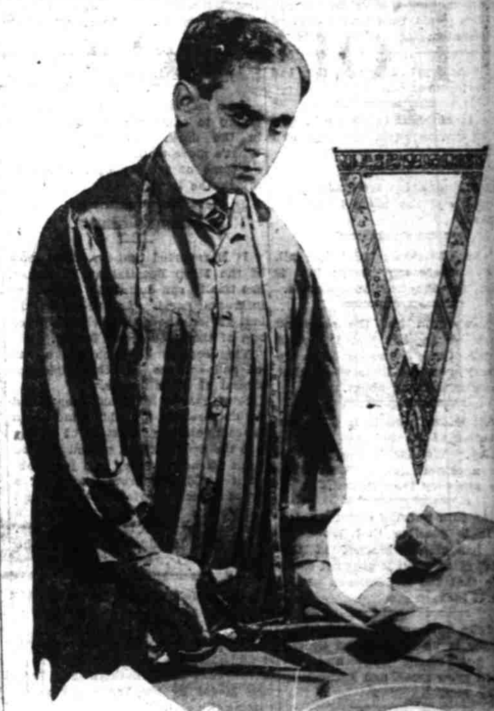
Leo Carrillo as Tito Lombardi in "Lombardi Ltd." at the Grand Opera House Monday, January 26