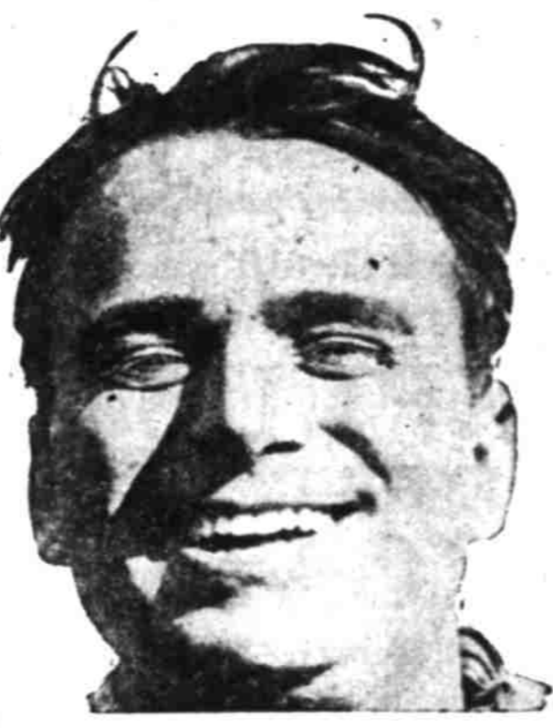
Continuous Show Today 2:15—4—5:45—7:30—9:15 P. M.

Alder at 10th Street PORTLAND, OREGON The most homelike hotel in Portland. All Oregon Electric trains stop at the SEWARD. Rates $1 and up. With private bath $1.50 and up. W. M. Seward, Manager.