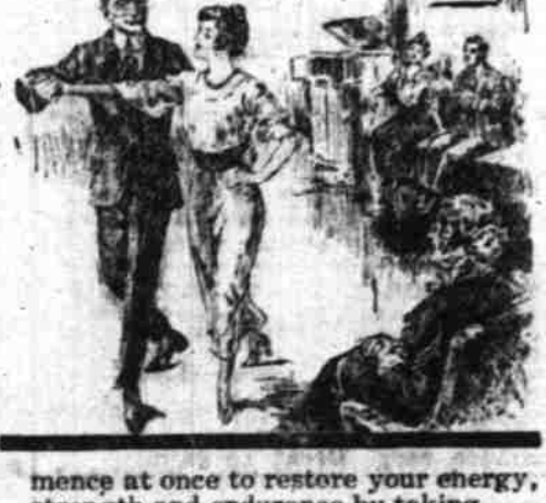
strength and endurance by taking

When you sense a feeling of slowing down of your physical forces—when your stomach, liver, kidneys and other organs show signs of weakness—when you notice a lack of your old time "pep" and "punch"—in other words, when you feel your vitality a on the wane, you should com-