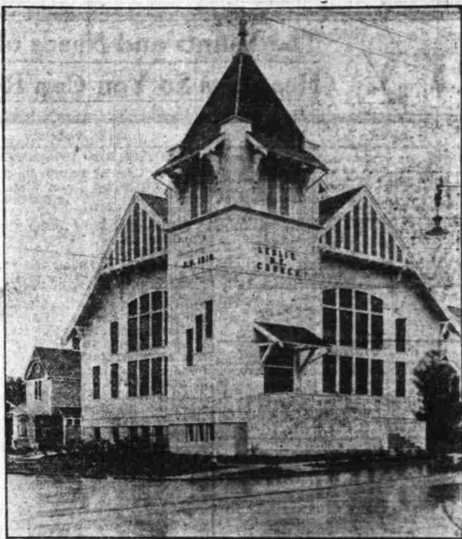
LESLIE METHODIST CHURCH

311 Commercial Street, Y. M. C. A. Building