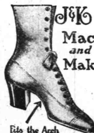
Fits the Arch

Enjoy the "pump" effect at the arch—the uplift that comes with each step. Let us explain the unlocked insole, the sidewise flexibility as well as the automatic "up and down" pumping.