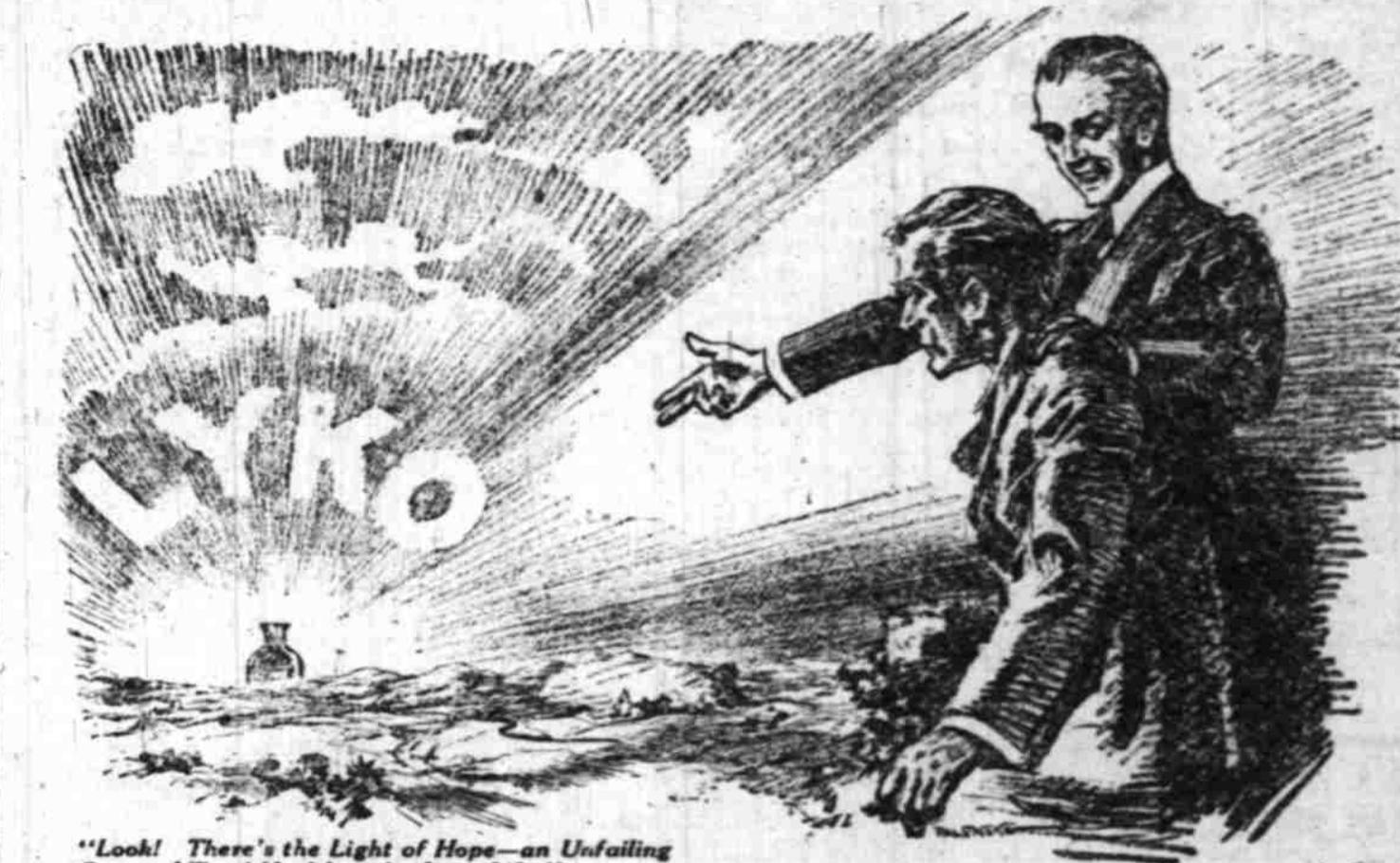
"Look! There's the Light of Hope—an Unfailing Omen of Good Health and a Long Life."