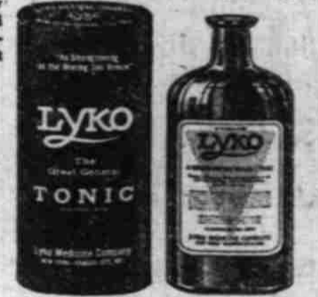
LYKO is sold in original packages only. See picture above. Refuse all imitations.

Sole Manufacturers LYKO MEDICINE COMPANY New York Kansas City, Mo.