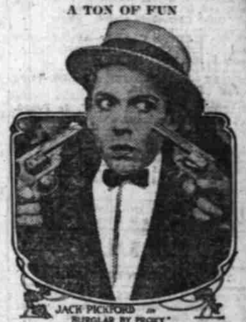
A TON OF FUN

Commercial and Court Sts. Formerly Chicago Store