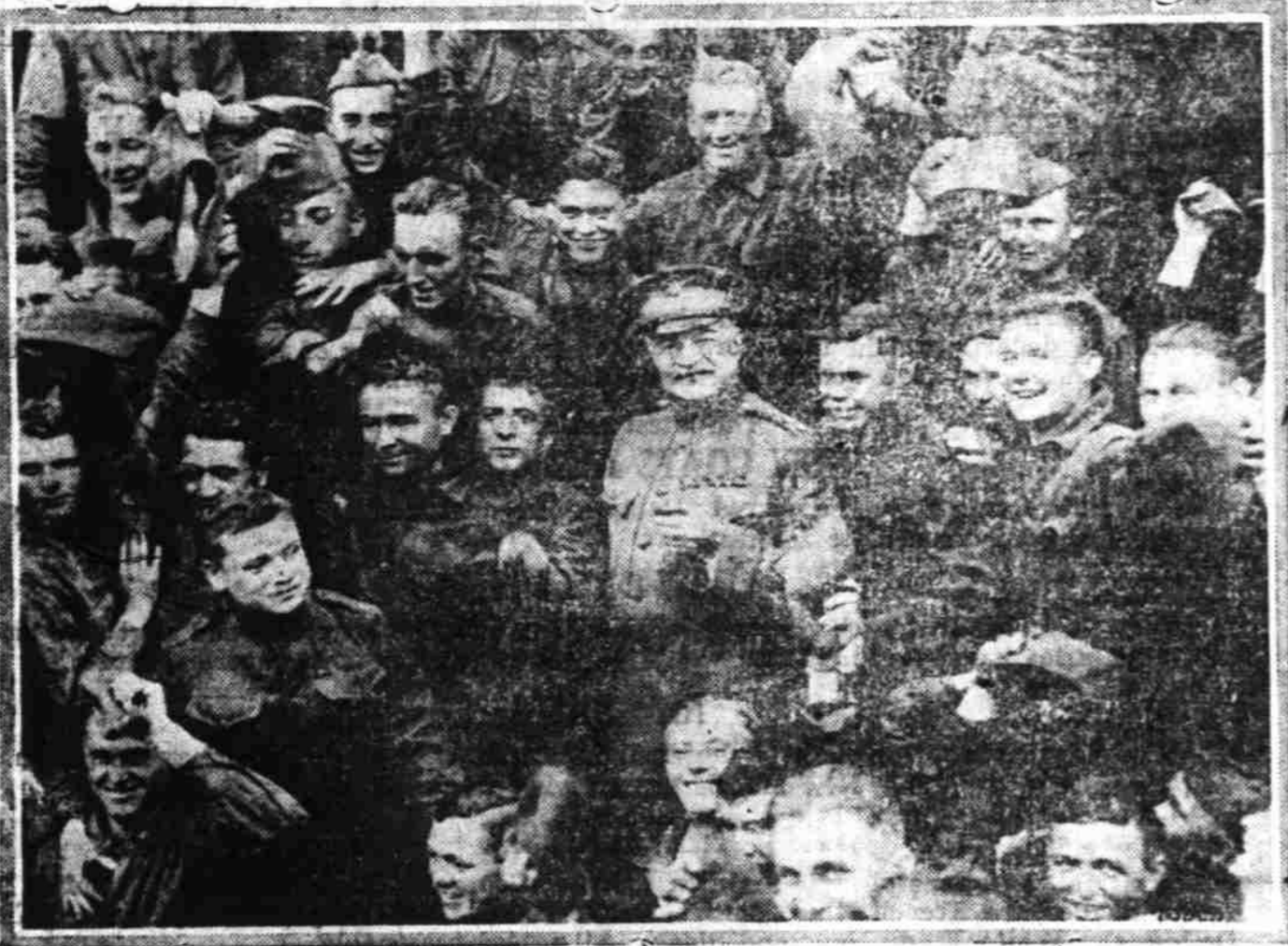
"I'll pose if you take my men with me in the picture. They went through hell with me and I want them to be photographed with me." This photograph is the result of the foregoing, spoken by Lieutenant-General Hunter Liggett, "Hero of the Second Marne." It was taken on his arrival in New York after as many as possible of the 2000 or more returning doughboys on board the Aquitania had crowded about the general.