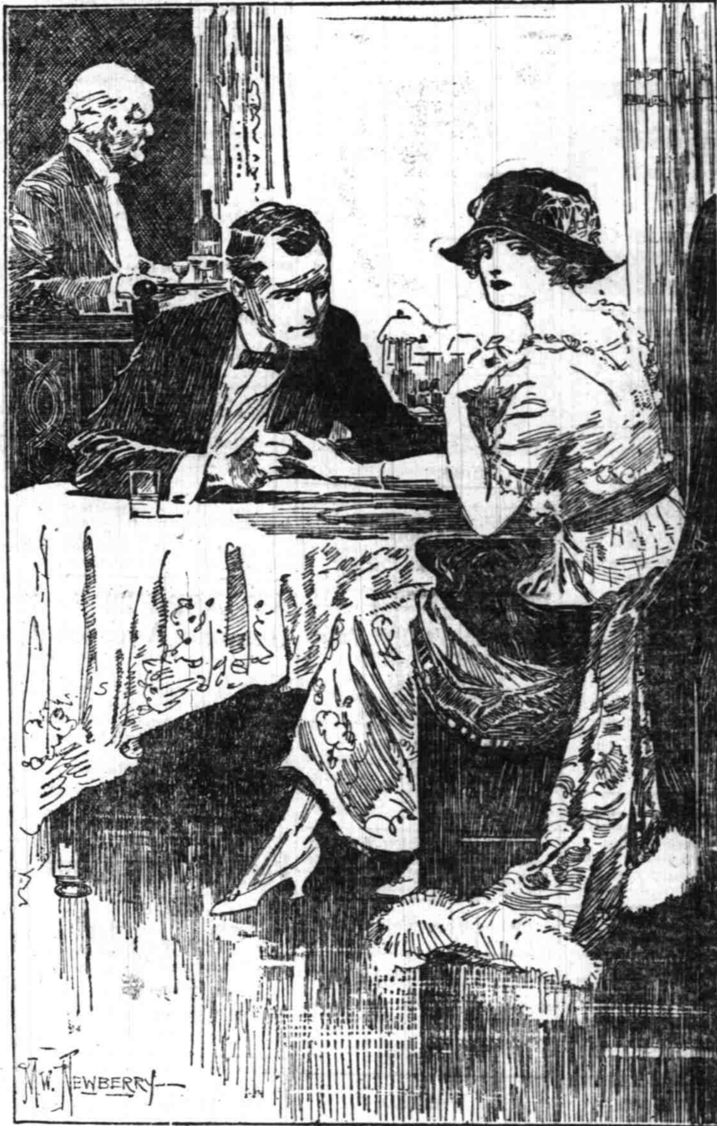
"Look at Me, Madge!"

The vast audience won by this fascinating romance of marriage, and the immense number of letters received from readers who have been eager for a book copy of the story they have been following from day to day, prove that this outpouring of a woman's heart has gone straight to the heart of humanity.