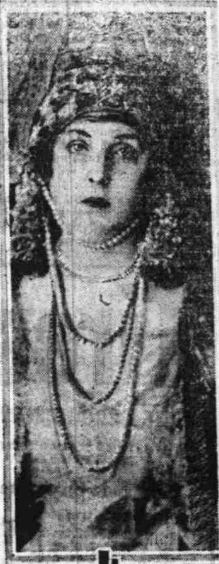
LADY DIANA MANNERS

While doing war work in England Lady Diana Manners met Captain Duff Cooper of the Grenadier Guards. Their engagement was announced recently. This is the latest photograph received in this country of the beautiful daughter of the Duke of Rutland, who found time in the midst of her labors in behalf of the wounded to fall in love.