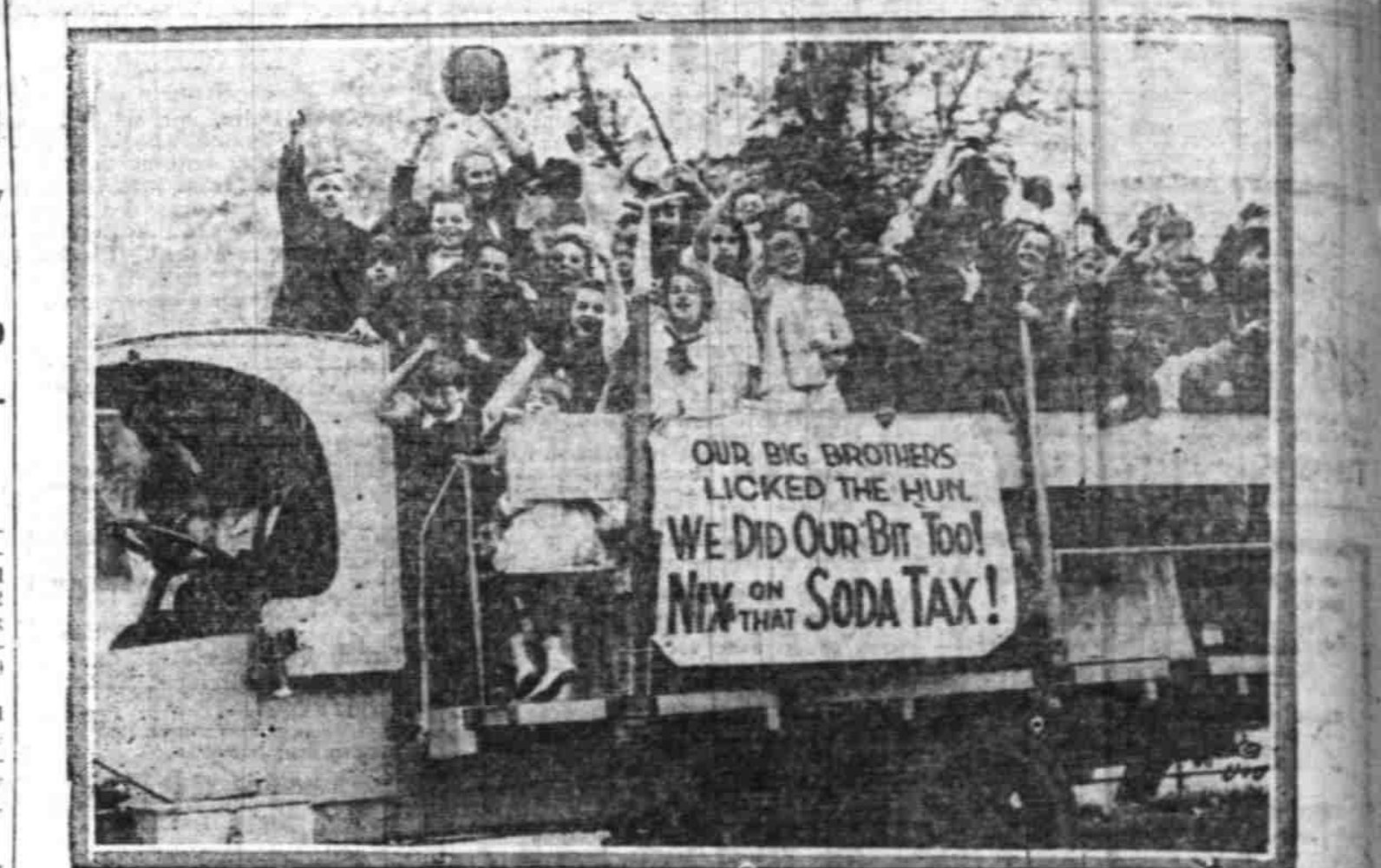
There have been several demonstrations by school children in Central Park, New York city, against the war tax on ice cream soda. Thousands of kiddies who thoroughly believe their rights are being invaded, have driven through the park and some of the principal streets in trucks bearing inscriptions such as "Our Big Brothers Licked the Hun. We Did Our Bit Too! Nix on That Soda Tax." This photograph shows a truckload of "conscientious objectors." They consider it just plain taxation without representation.