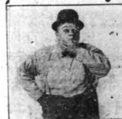
FATTY ARBUCKLE In "SCRAPS OF PAPER"