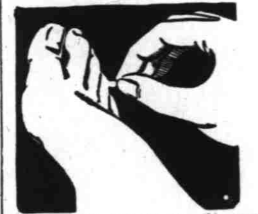
Use "Gets-It" peel off corn this way.

It's almost a picnic to get rid of a corn or callus the "Gets-It" way. You spend 2 or 3 seconds putting on 2 or 3 drops of "Gets-It" about as simple as putting on your hat. "Gets-It" does away forever with "contraptions," "wrappy" plasters, greasy ointments that rub off, blood-letting