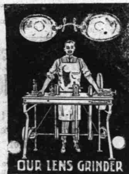
OUR LENS GRINDER