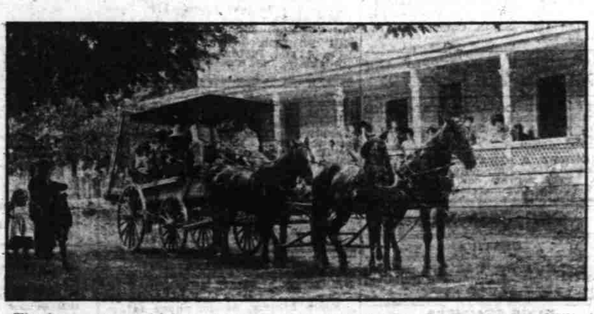
The horse stage which used to carry passengers from the "station" to Wilhoit