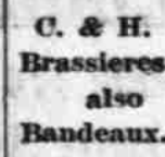
C. & H. Brassieres also Handeaux.

Designed for all athletic wear in giving freedom for all kinds of movements. A number of different models designed to meet the various types of figures.