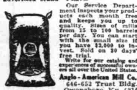
Write for our catalog and see how our successful men are all over the United States.

$150 to $1,000 per month can be made with this permanent, substantial and dignified business.