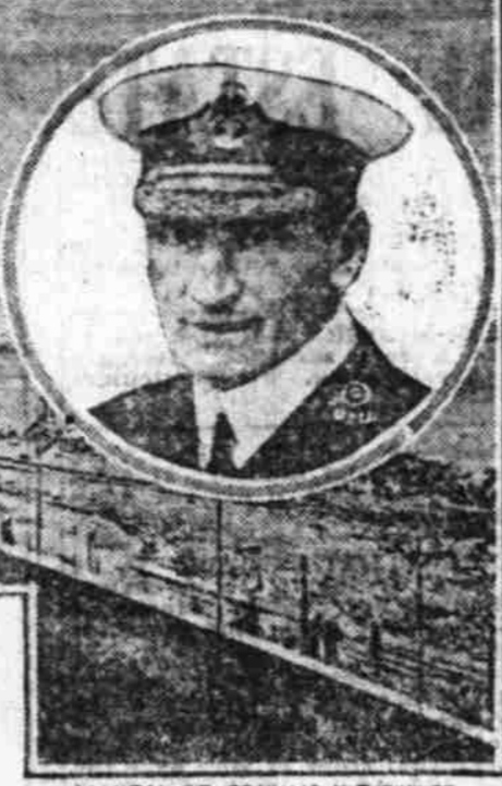
ADMIRAL SIR REGINALD TYRWHITT

al canteens and there will be a canteen in the hut to fill the needs in this direction. A secretary will be assigned to permanent duty at the trench camp.