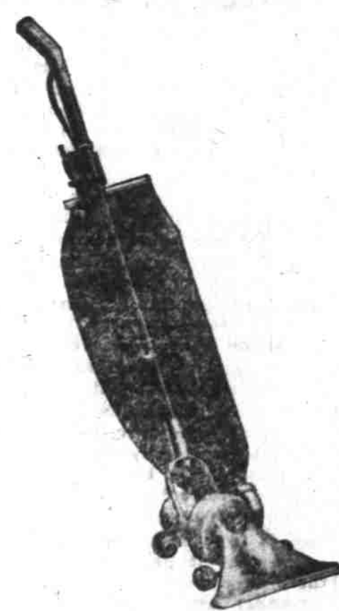
The entire nozzle width measures 14 inches, and it's unusually long, poking construction gives it the "Submarine" title, because it GETS UNDER things.